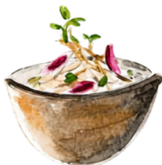
SOBA NOODLES, STRAWBERRIES, PEAS 冷しそば