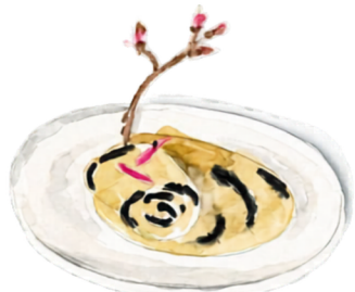
EGGPLANT, BLACK AND WHITE SESAME ナスの味噌ごま和え