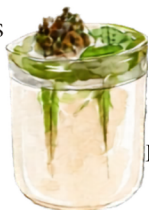
FENNEL SOUP WITH BLACK GARLIC CREAM フェネルスープ、黒にんにくの香