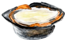
TOFU STYLE « DENGAKU » 豆腐田楽