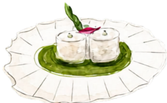
CUCUMBER AND SHISO MAKI CELERY SAUCE 野菜巻き、セロリのミルク